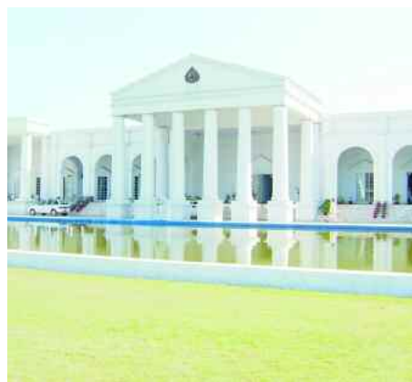
Lahore Textile and General Mills